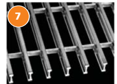
I-bar Rectangular Opening