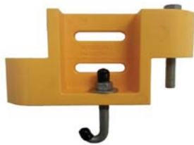
T5 - J