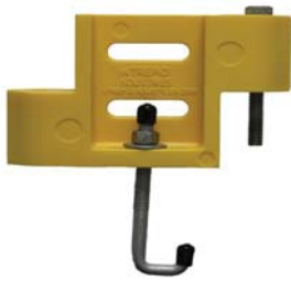
T5 - L